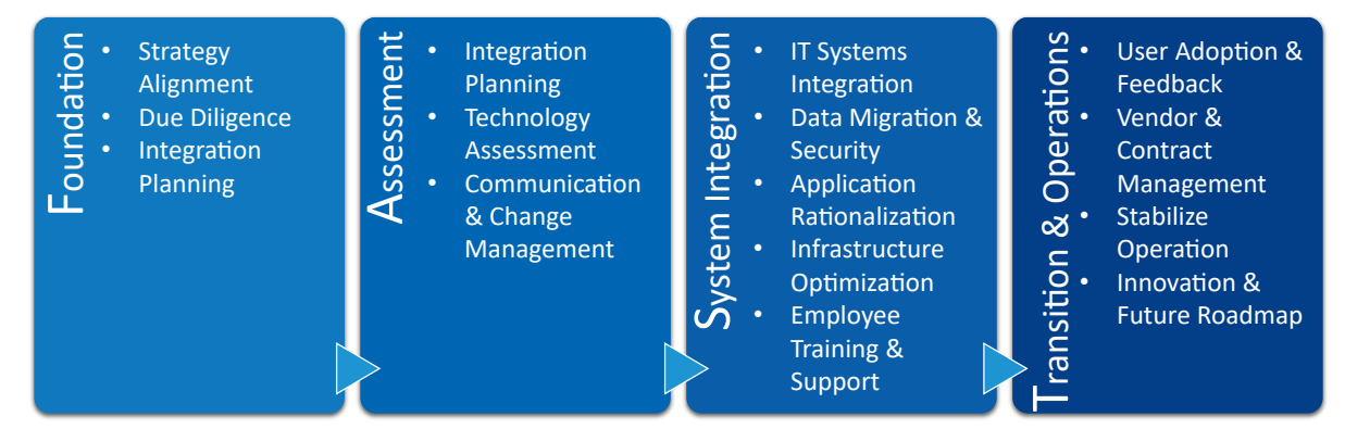
Infosys Modern Workplace's M&A service offering provides organizations with the capabilities they need to Integrate their IT environment to improve efficiency, security, and productivity. Our transformation solution, shown below, is built on top of the FAST framework.

Infosys, in partnership with Quest, offers optimal solutions for M&As and D&Cs for integration, consolidation and management of on-premises, cloud, and hybrid IT ecosystems. Our certified experts bring the best out of the Quest tool and apply agile methods to enterprise clients' business strategies to drive value from the workplace environment across the M&A and D&C lifecycle. The FAST (Foundation, Assessment, System Integration, Transition & Operations) framework is designed to be flexible and adaptable so that it can be tailored to the specific needs of each merger.